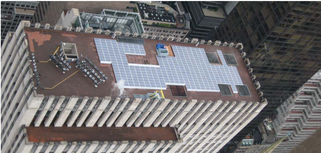
A bird's eye view of the array at 45 Rockefeller Center.